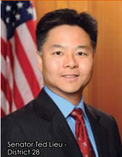
Senator Ted Lieu - District 28

Looking for a better life, Senator Ted Lieu's family immigrated to the United States when he was three years old. With the support of hard-working parents and a country that provided limitless opportunity, Senator Lieu attended Stanford for his undergraduate degrees in Computer Science and Political Science, and Georgetown University for his law degree.