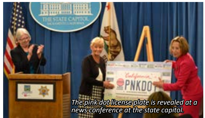
The pink dot license plate is revealed at a news conference at the state capitol.

The program is a way to raise awareness for the need for organ and tissue donors. More than 21,000