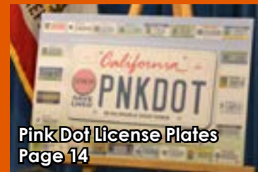
PinkDot License Plates Page 14