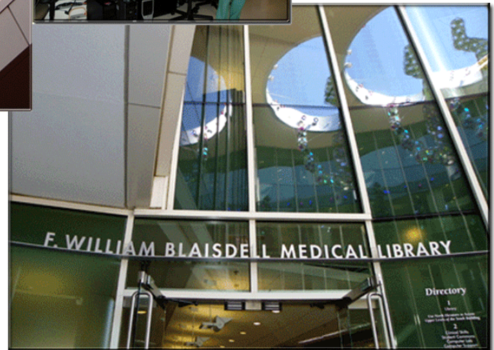
(Board Members and staff tour U.C. Davis Medical School and new Surgery and Emergency Services Pavilion.)