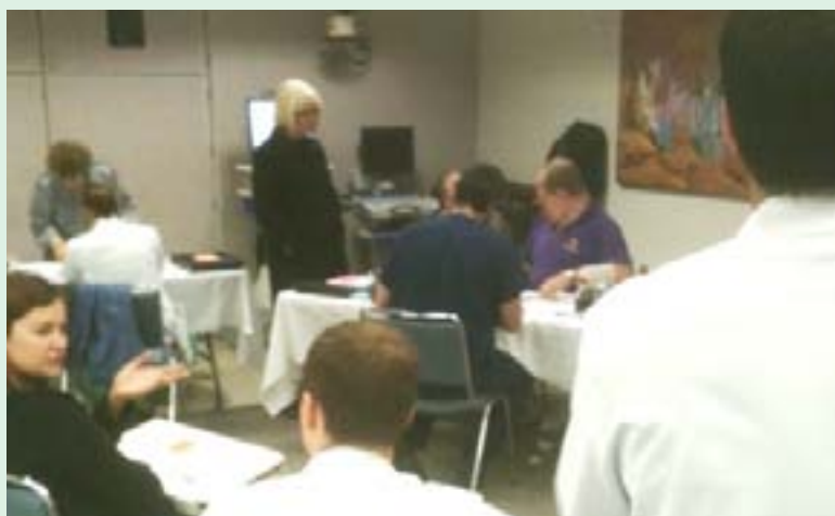
Licensee applicants learn about the Medical Board's licensing process.