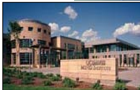
UC Davis MIND Institute, Sacramento, CA