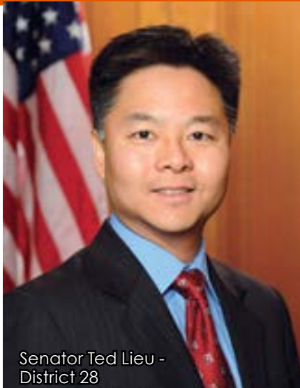
Senator Ted Lieu - District 28

Looking for a better life, Senator Ted Lieu's family immigrated to the United States when he was three years old. With the support of hard-working parents and a country that provided limitless opportunity, Senator Lieu attended Stanford for his undergraduate degrees in Computer Science and Political Science, and Georgetown University for his law degree.