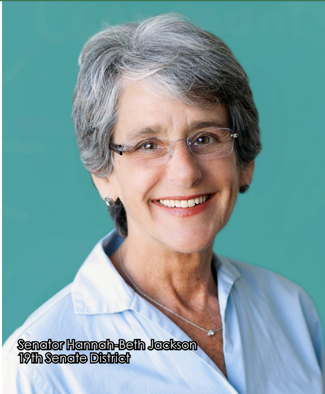
Senator Hannah-Beth Jackson 19th Senate District

During her time in the Legislature, Senator Jackson has become known as an effective advocate for protecting the environment, advancing legislation to reduce gun violence, championing equality for women, advocating for commuter rail, improving access to early childhood education, supporting veterans and Veterans Treatment Courts, and supporting access to justice for all Californians, among other issues.