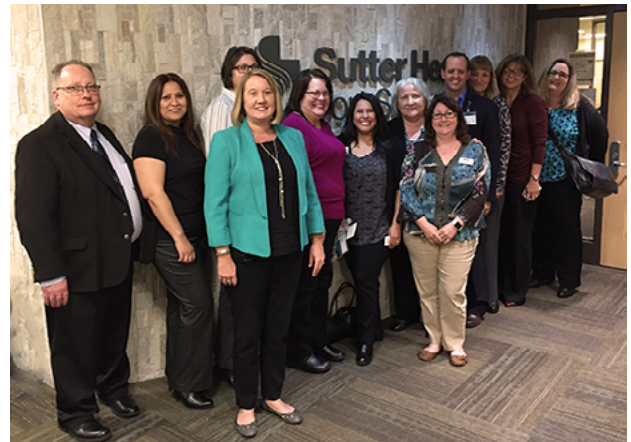
On Thursday, February 25, 2016, staff of the Medical Board of California (Board) toured the Fort Sutter Surgery Center to see firsthand the operations of an outpatient surgery setting. Pictured here are Board staff and staff from the Fort Sutter Surgery Center and the California Ambulatory Surgery Association.

In addition to the existing requirement for credentialing, the law now requires that each licensee who performs procedures in an accredited outpatient surgery setting be peer reviewed, at least every two years, by licensees who are qualified by education and experience to perform the same types of, or similar, procedures. The peer review is defined as a process in which the basic