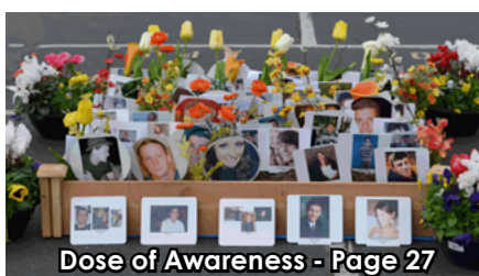
Dose of Awareness - Page 27