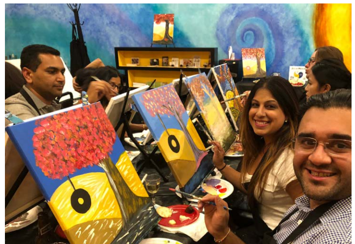
Physicians enjoying some paint, wine and fellowship.