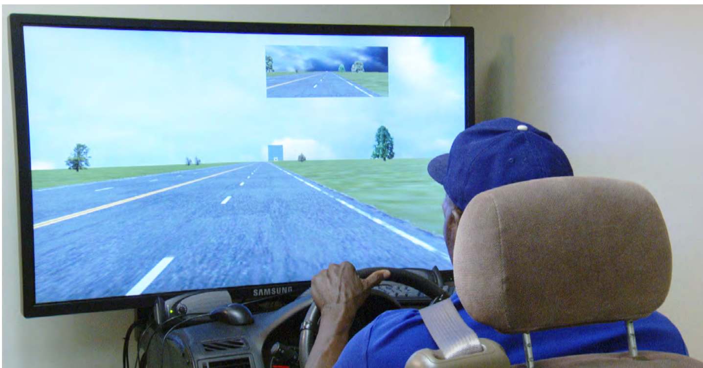
An elderly motorist is tested on his driving ability using state-of-the-art technology used by driving rehabilitation specialists across the state to determine if someone can drive safely.