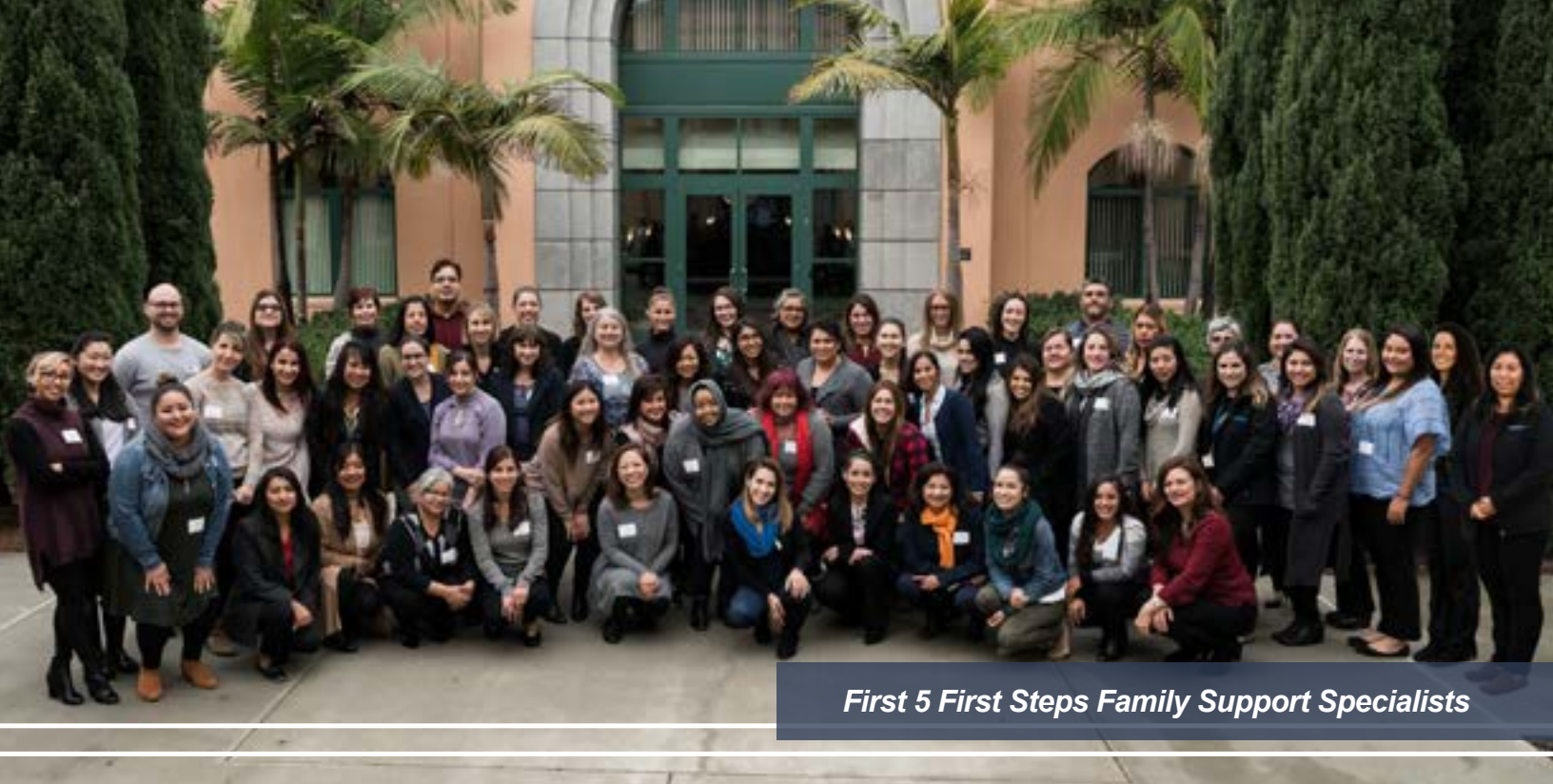
First 5 First Steps Family Support Specialists

Together, family support specialists and parents talk about the parent's hopes and goals, how to make learning fun for their kids, and how to use positive parenting strategies. They connect families to doctors, community programs, and resources – teaching parents stress-management techniques and ways to strengthen their communication within the family.